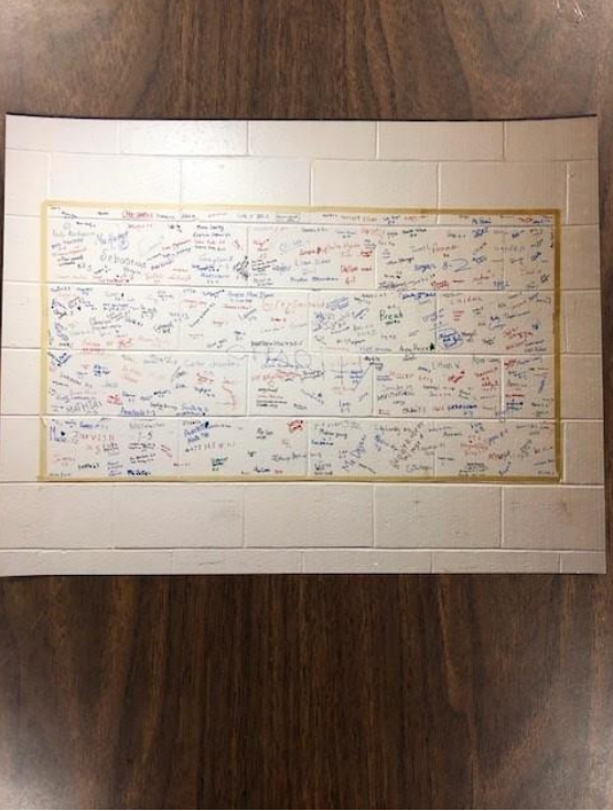
Figure 1: LT School Community Signatures