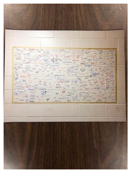
Figure 1: LT School Community Signatures